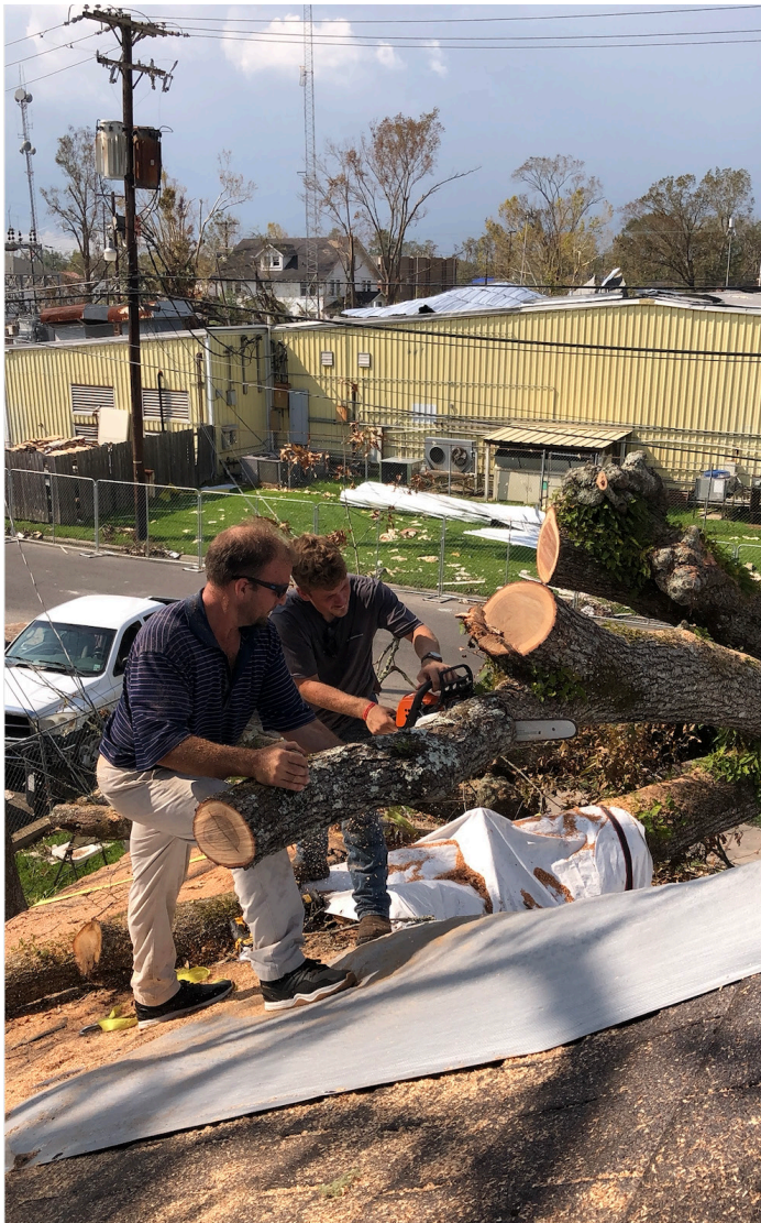
Removing the tree, piece by piece.